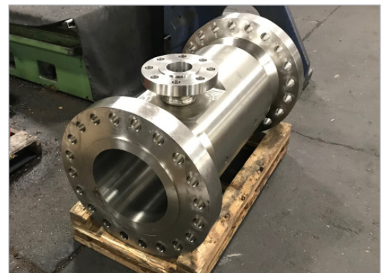
20183 Venturi Tube