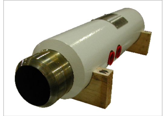
30100 Venturi Tube