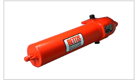
CB/CBB - Series

Enertech is your authorized sales and services distributor for Bettis actuators used in U.S. nuclear power plants.