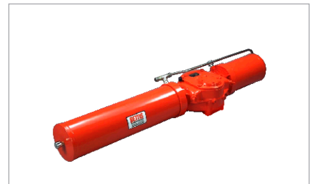
HD - Series