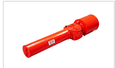
T - Series