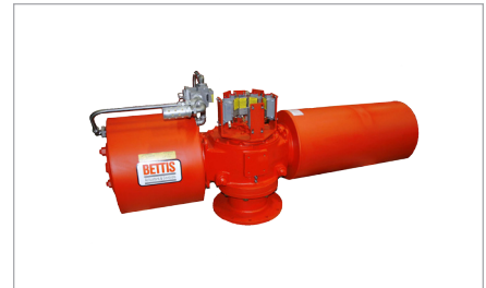
G - Series