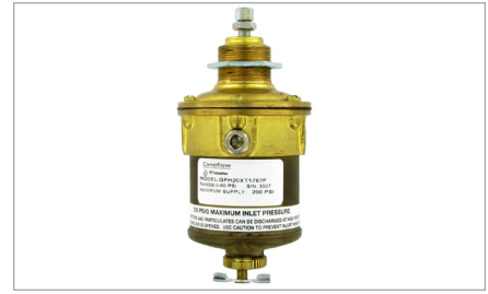
GFH25 Air Filter Regulator

Enertech is your authorized sales and services distributor for ITT Conoflow products used in worldwide nuclear power plants.