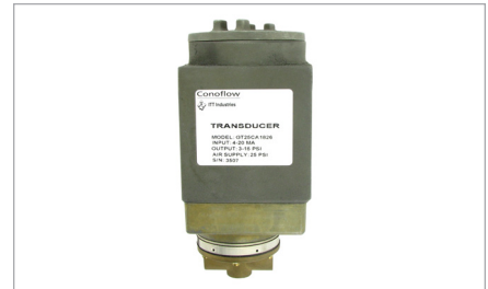
GT25 I/P Transducer